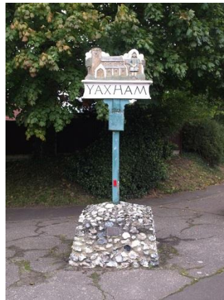
Yaxham village sign